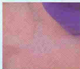
Appearance of lesion in incandescent light