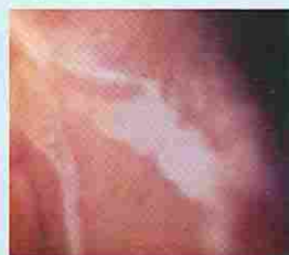
Under ViziLite illumination

ViziLite Plus ORAL LESION IDENTIFICATION AND MARKING SYSTEM